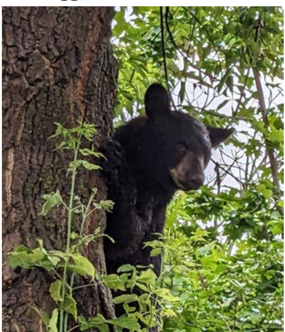
A cub climbs a tree on Saturday night on Greenbush Road.