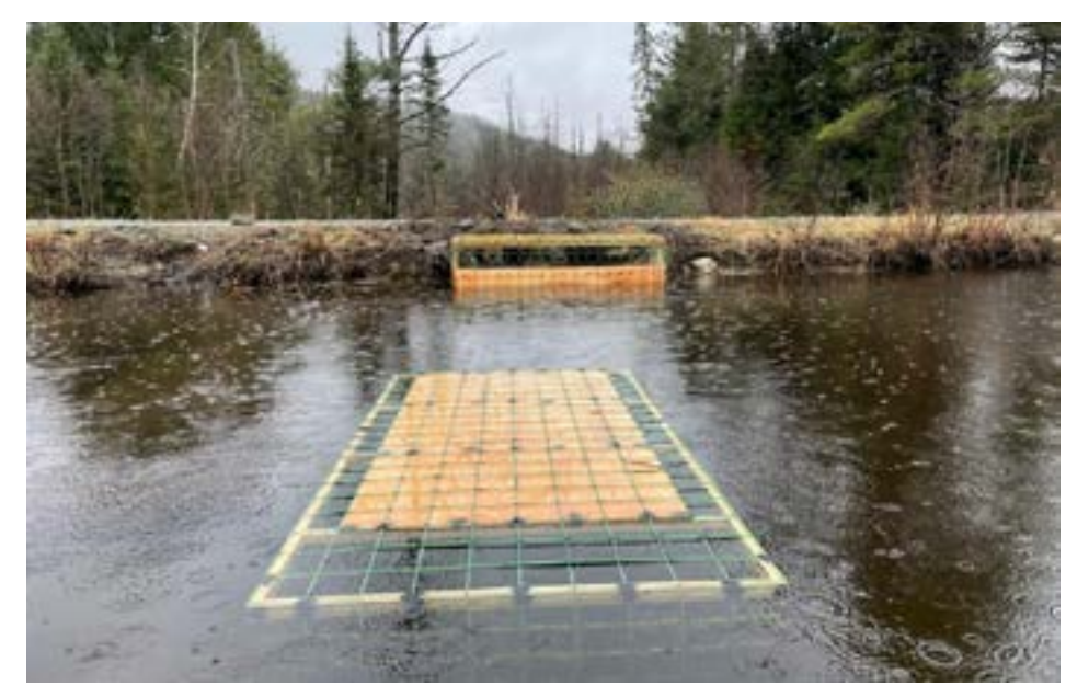
The Beaver Deceiver offers beavers an inviting place to build a dam, but water still flows through so wetlands are preserved but property and roads are not flooded.